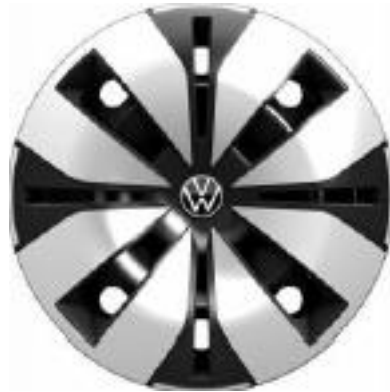
18" steel wheels (incl. bi-colour trim)

STANDARD ON ID.Buzz Cargo Comfort. OPTIONAL on ID.Buzz Cargo.