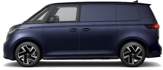
Starlight Blue Metallic 1 3S3S