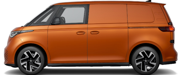
Energetic Orange Metallic 1 4M4M