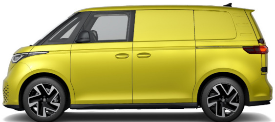
Pomelo Yellow Metallic 1 C1C1