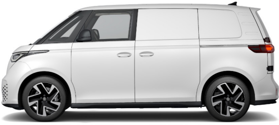
Candy White Solid 1 B4B4