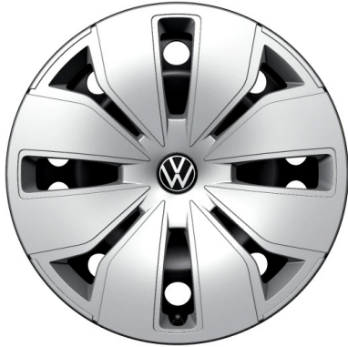
18" steel wheel (incl. trim)