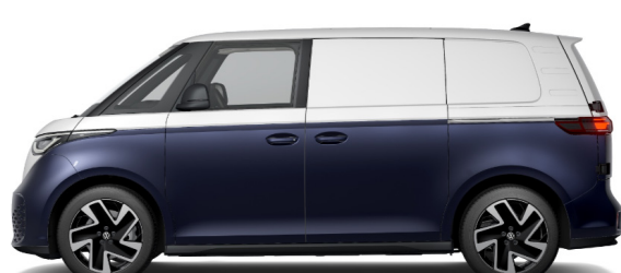
Candy White/ Starlight Blue Metallic 1 9530