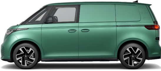
Bay Leaf Green Metallic 1 C4C4