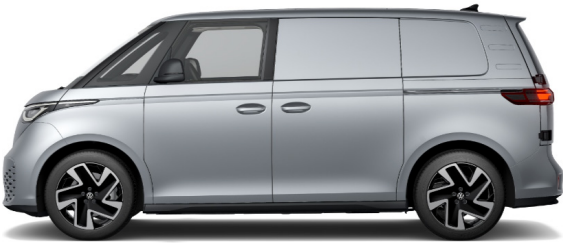
Mono Silver Metallic 1 K9K9