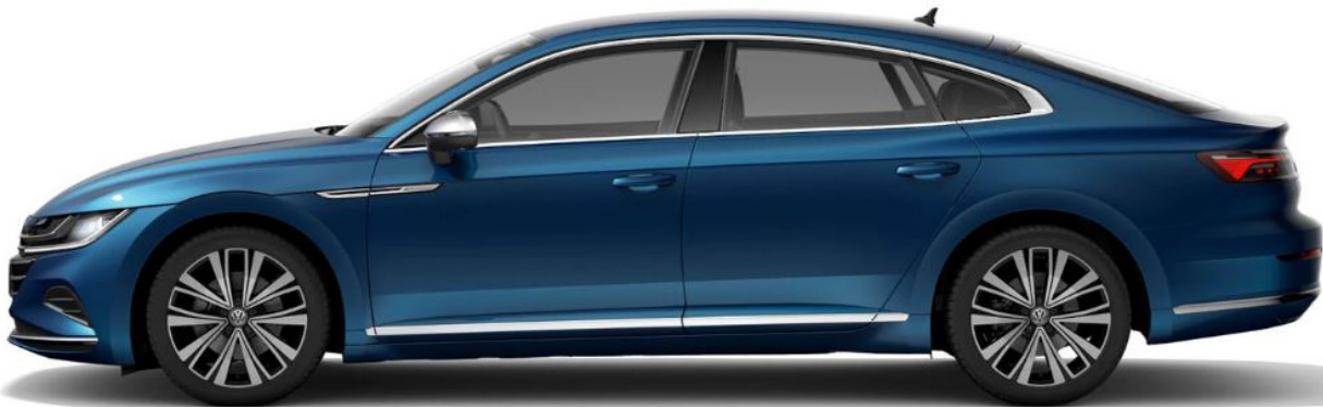
The above image shows optional Kingsfisher Blue metallic paint