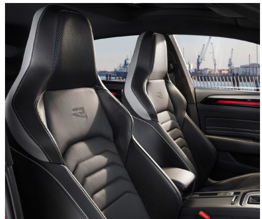
The above images show optional "Nappa" leather pack R-Line, with optional ErgoComfort seats