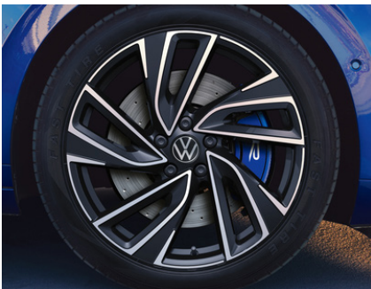
STANDARD ON R-MODEL 19" 'Adelaide' alloy wheels 8J x 18 Tyres: 245/45 R18