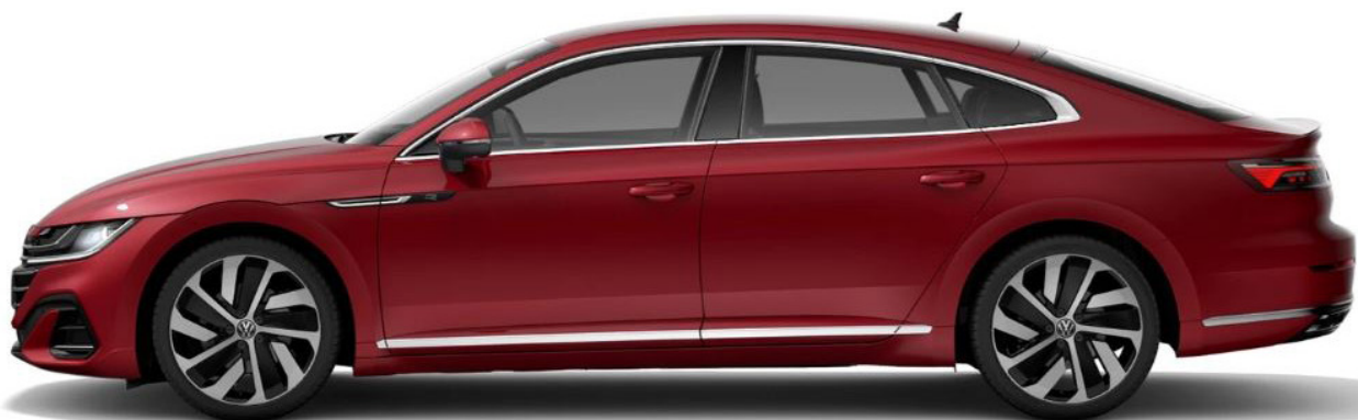
The above image shows optional Kings Red metallic paint

The above specifications are for information purposes only as our products are continually updated and changes may be made to the specifications at any time. If you require any specific feature, you must consult your local dealer who is regularly updated with any change in specification. Specifications are subject to change without notice.