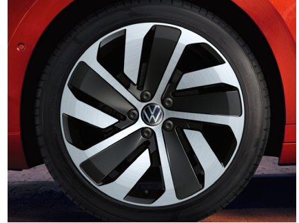
STANDARD ON R-LINE 19" 'Montevideo' alloy wheels 8J x 19 Tyres: 245/40 R19