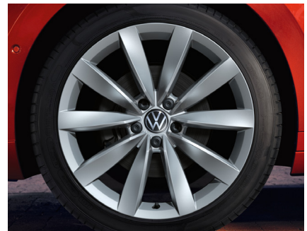
OPTIONAL ON ELEGANCE 19" 'Chennai' alloy wheels in Adamantium Silver 8J x 19 Tyres: 245/40 R19