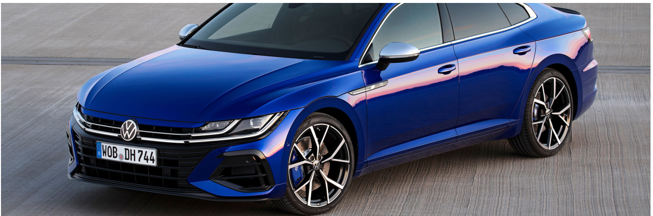
The above image shows optional Lapiz Blue metallic paint with optional 20" Estoril alloy wheels

The above specifications are for information purposes only as our products are continually updated and changes may be made to the specifications at any time. If you require any specific feature, you must consult your local dealer who is regularly updated with any change in specification. Specifications are subject to change without notice. Effective from 25 May 2021, for production from CW48/2020 onwards. All prices include VAT and VRT. These prices are subject to change once technical data comes available.