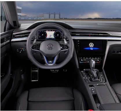
The above image shows optional Navigation System Discover Pro 9.2" display