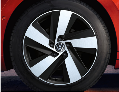
STANDARD ON ARTEON 18" 'Valdemossa' alloy wheels 8J x 18 Tyres: 245/45 R18

The addition of optional extras may result in the vehicle increasing in Co2 g/km and therefore, attracting a higher rate of VRT than described in this product guide. For your exact configuration value, both Co2 g/km and RRP, please visit volkswagen.ie configurator.