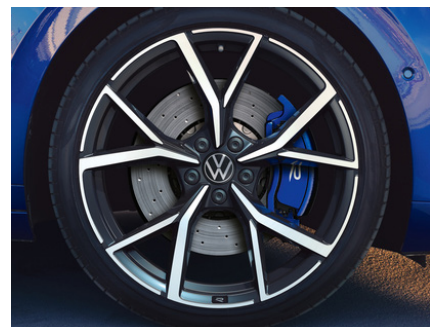
OPTIONAL ON R-MODEL 20" 'Estoril' alloy wheels 8J x 20 Tyres: 245/35 R20

The addition of optional extras may result in the vehicle increasing in Co2 g/km and therefore, attracting a higher rate of VRT than described in this product guide. For your exact configuration value, both Co2 g/km and RRP, please visit volkswagen.ie configurator.