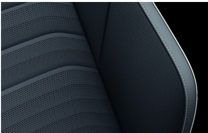
"Nappa" leather* (WL6) Titan Black (TO) Optional on Elegance models

* Optional at extra cost. • Please note, the print processes do not allow exact reproduction of the upholstery colours.