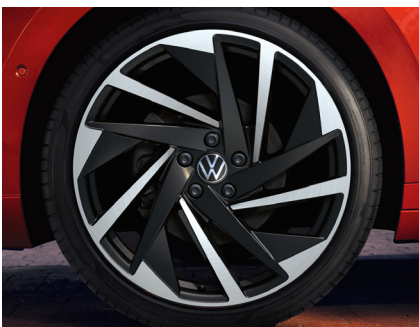
OPTIONAL ON ELEGANCE & R-LINE 20" 'Nashville' alloy wheels 8J x 20 Tyres: 245/35 R20