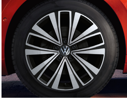
STANDARD ON ELEGANCE 18" 'Muscat' alloy wheels in 8J x 18 Tyres: 245/40 R18