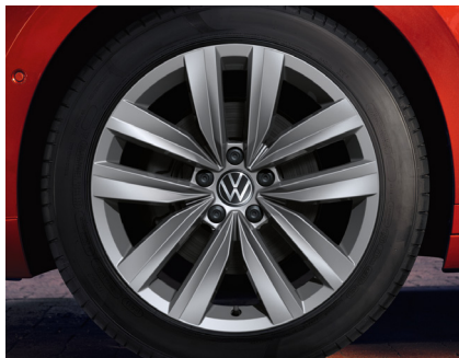
OPTIONAL ON ARTEON & ELEGANCE 18" 'Almere' Adamantium Silver alloy wheels 8J x 18 Tyres: 245/45 R18