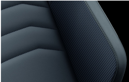
"R-Model Nappa/Carbon" leather* Titan Black (OH) Standard on R Model