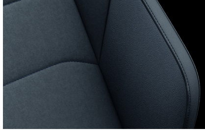
"ArtVelours Microfleece/Vienna" cloth & leather Titan Black (TO) Standard on Elegance