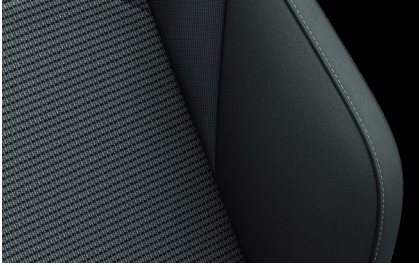
"Sideways" cloth Titan Black (TO) Standard on Arteon models