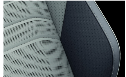
"Nappa" leather* (WL6) Mistral/Raven (YS) Optional on Elegance models