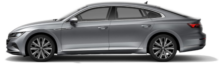
Pyrite Silver Metallic*