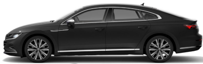
Urano Grey Solid