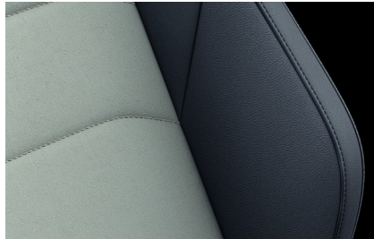
"ArtVelours Microfleece/Vienna" cloth & leather Mistral/Raven (YS) Optional on Elegance models