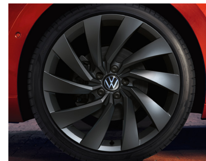
OPTIONAL ON R-LINE 20" 'Rosario' black alloy wheels 8J x 20 Tyres: 245/35 R20